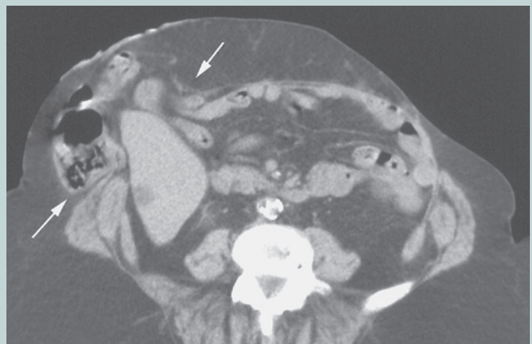
■ Fig 2. CT demonstration of complex Spigelian hernia containing small and large bowel, fat and liver.